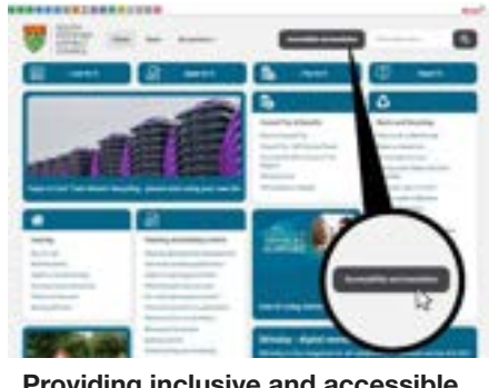
Providing inclusive and accessible services for residents